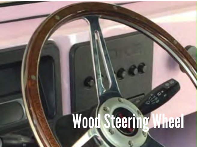
Wood Steering Wheel