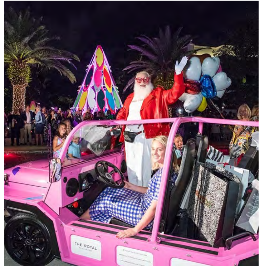
Moke America's on-site activation at the Royal Poinciana Plaza in Palm Beach (Nov/Dec 2018). Pictured here, Martha Stewart and Santa.